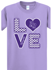
River Ridge LOVE (NEW)