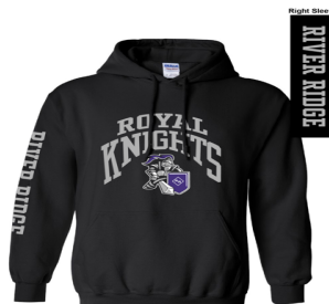
Black Royal Knights Hoodie (NEW)