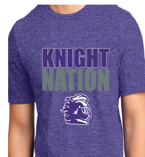
Knight Nation Purple Short Sleeve T-shirt