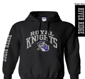
Black Royal Knights Hoodie (NEW)