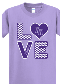
River Ridge LOVE (NEW)